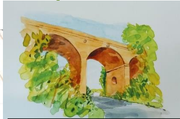
Northington Rd Viaduct stage 9

WW West to Kings Worthy, partly along track bed of old Watercress Line